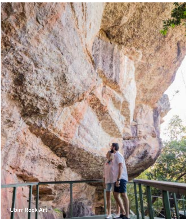
Ubirr Rock Art

10 DAYS Darwin • Mary River • Kakadu National Park • Katherine Gorge • Litchfield National Park • Alice Springs • West MacDonnell Ranges • Kings Canyon • Kata Tjuṯa • Uluru