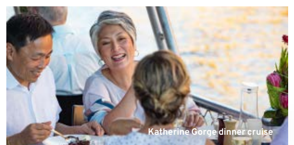
Katherine Gorge dinner cruise