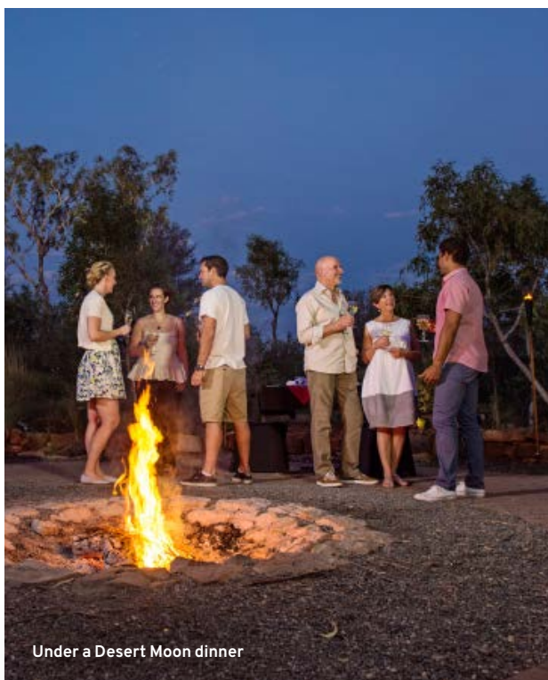
Under a Desert Moon dinner

🍽️ Breakfast, lunch, Local Dining Experience